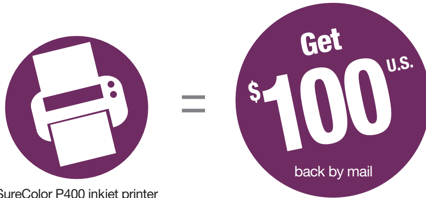
SureColor P400 inkjet printer

Purchase a SureColor ® P400 or SureColor P600 inkjet printer and receive the following back by mail: