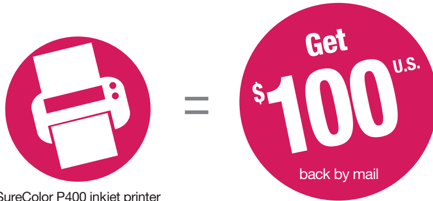
SureColor P400 inkjet printer

Purchase a SureColor ® P400 or SureColor P600 inkjet printer and receive the following back by mail: